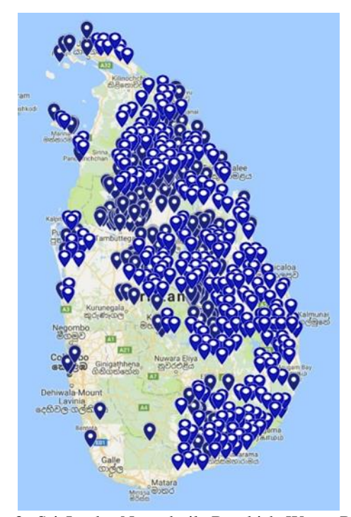
Figure 3: Sri Lanka Navy built Brackish Water Reverse Osmosis Plants in Chronic Kidney Disease of unknown etiology impacted areas in Sri Lanka.

SLN established more than 1,000 BWRO plants in Jaffna, Mullative, Killinochchi, Anuradhapura, Polonnaruwa, Kurunegala, Puttalam, Monaragala, Badulla, Trincomalee, Ampara, Hambanthota, and Matale districts as Figure 3. Then, in this study, 18 BWRO locations were selected and investigated for groundwater quality by covering the districts which are highly CKDu-impacted.