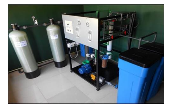
Figure 2: Brackish Water Reverse Osmosis Plant built by Sri Lanka Navy.

The BWRO plant capacities were defined as 5 and 10 Tons/Day by SLN as shown in Figure 2. Consequently, it has been recognized that most of the BWRO plants contained membranes in parallel to the applications and the recovery ratio is an average of 39% - 50%, and membrane lifetime is limited to one year or a little more as per the operator's skill. SLN operators are manning BWRO plants around the clock and are ready to supply safe drinking water for consumers at any given time. Further, they are providing 20 L for family and maintaining records daily basis. Subsequently, SLN BWRO operators are carrying out daily backwashing 100% and ensuring all the operating parameters are within specified limits. Therefore, regular defects and membrane clogging are not taking place compared to CBO-operated BWRO plants [12]. In addition, monthly returns are evident that the maintenance cost of SLN BWRO plants is minimal (annually 250 USD), and issuing more than 5,000 L per day of safe drinking water to the CKDu-impacted community.