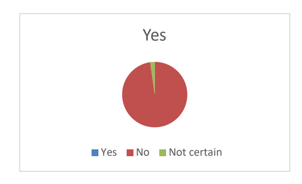
Chart 02: Respond for lighting up the chamber

Most of them were like to keep the chamber dark. It proves when asking about whether they like to light up inside the chamber, a higher percentage were responded as "NO". Shown in below chart.