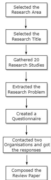
Figure 1: Research Methodology followed for the Study.

The research issue that can be derived from the chosen research subject is "How to minimize software maintenance costs while maintaining software quality," and it has to do with the difficulty of striking a balance between the cost of software maintenance and the requirement to maintain software quality. Although it is a crucial step in the creation of software, software maintenance may be expensive in terms of both time and money. Maintaining software quality is crucial to ensuring that software systems are dependable and fulfill end-user requirements. The challenge in this research is to find solutions to lower maintenance expenses without compromising software quality.