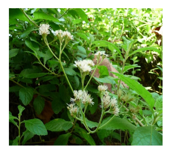
Fig. 1. Flowers, fruits, and leaves of J. zeylanica [34]

Samaraweera et al.; Asian Plant Res. J., vol. 10, no. 4, pp. 21-34, 2022; Article no.APRJ.94862