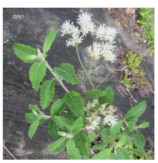
Fig. 4. J. zeylanica whole plant [39]

Easy, alternative white with fine wool beneath, 3.7-8.5 cm long, 1.7-3.5 cm wide, fiddle-shaped auriculate at base, obtuse or subacute at apex, strongly crenate and undulate, delicately