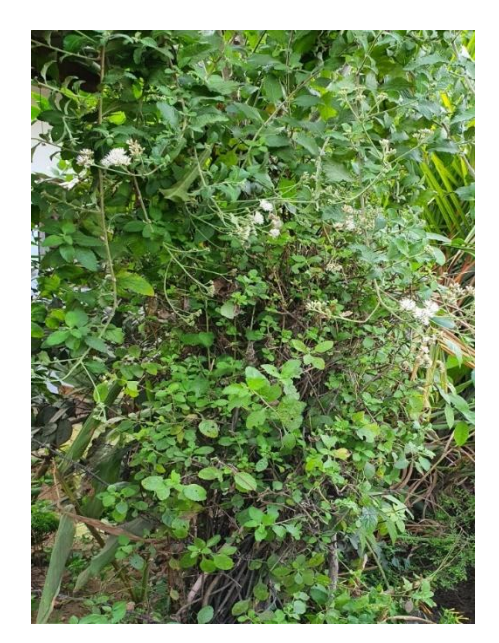
Fig. 3. Photograph of J. zeylanica whole plant

member of the family ASTERACEAE. J. zeylanica is a small under shrub (0.5-) 1 - 2.5 m tall with many strangling, divaricate, cylindrical branches that are finely tomentose when young [32-35].