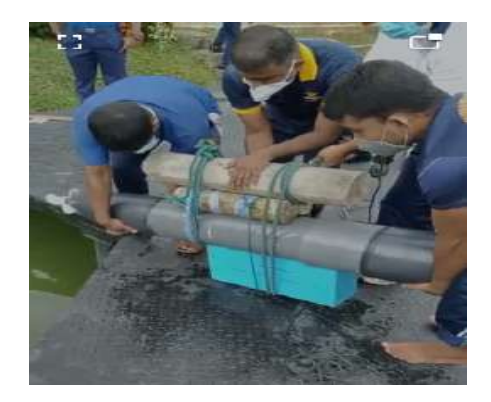
Figure 4. Preliminary stability testing at KDU lake.

neutrally equilibrium condition even in extreme wave conditions. The constructed vessel was tested at sea and KDU swimming pool under varying wave conditions to ensure safe operations in both sea and freshwater conditions.