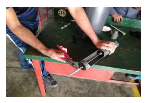
Figure 2. Preliminary stages of construction of AUV

impacts on the hydrodynamics of AUV. With this propulsion system, the speed of the vessel can be varied by a wireless remote controller, overriding the function of a conventional AUV and optimizing its capabilities in rough sea conditions. Figure 2 and Figure 3 depicts the preliminary stages of construction of AUV.