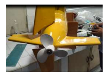
Figure 5: Rudder testing at hydrodynamics laboratory, KDU

lift to maneuver the vessel even against strong wave conditions. Further, improved response to the command is another cause of improved maneuverability of our design. These rudders are operated with linear actuators and capable of changing its course as per the given command by the rudder control system. However, the fixed planes provide stability to the vessel.