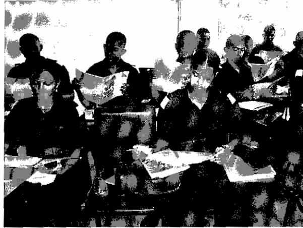
Students looking at a module of English material at KDU.

The English instructors in the KDU took on a major task last year by putting together ten modules of material for the English Intensive Course. This material was printed with the support of the MCSP and was trialed with the last group of Officer Cadets. The materials are very attractive and have proved very popular with students in KDU and in other places in the military.