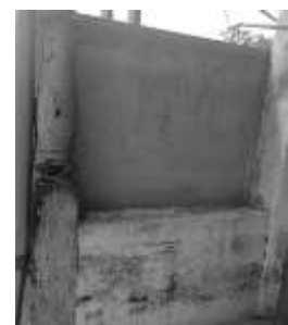
Figure 9- Pila kotuwa in the verandah-Source-Author

Doors in the interior have ornamentation on their fanlights, these decorations portray traditional Sinhalese designs in the form of timber carvings such as Liyawal (Fig 10). There is a decorative valence board which