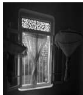
Figure 10- windows with liyawal designs on the fanlights

Doors in the interior have ornamentation on their fanlights, these decorations portray traditional Sinhalese designs in the form of timber carvings such as Liyawal (Fig 10). There is a decorative valence board which