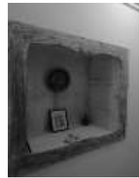
Figure 12: Niche created within the wall.

walls provides a very good level of thermal comfort. The plastered surface of one wall has degenerated, however the rubble brown texture underneath the plaster is very striking and this wall has been used as a feature wall. (Fig 13). These features go on to show that the novelty of colonial architectural never fades off. There is a seating, resembling a pilla kottae which allows to comprehend with the narrow street.