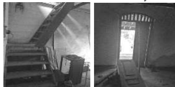
Figure 2: The ladder- like staircase, Source- Author Figure 3: Upper Floor, Source- Author

Space Formulation- The plan form and the section form of all these shophouses are very simple and it adheres to the golden proportions in terms of measurements. There is a verandah, living area and towards the rear there is a kitchen space. As Figure 2 indicates, a timber staircase is niched in a limited space which corresponds to more of a ladder than a conventional stairway as the