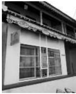
Figure 13 the grills have been replaced with glass

The Architectural appreciation of the Modern Variant of the Shophouse