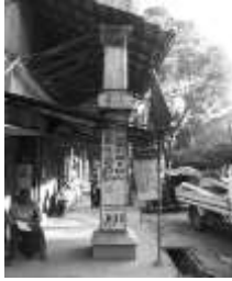
Figure 14-undefined gable ends