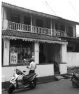
Figure 12- the lattice grills of the shop is visible

There is a shop already in existent in the verandah of one of the shiophouses. However for the purpose of collecting information for this research this shophouse was visited thrice and during the course of time changes could be visible. During the last visit the shop in front was being re-built. Changes such as the earlier lattice grills were replaced by glass could be seen (Fig 12,13).