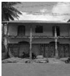
Figure 4- Bright coloured walls

between 20"-25". These walls stand on rubble foundations which were of two and a half feet in width and depths up to one and half feet. The Dutch constructed these walls out of coral stones with lime mortar which provided coolness into the interiors. Most of the wall plasters have been exposed in the present state of this shophouse. The walls also symbolizes a form of ornamentation-ornamentation in terms of flat surfaces such as paintings, wall color- the exterior walls of this shophouse are of orange and pink, in the present day the colors have peeled off (Figure 3,4). It is evident that bright colors would have been used during the colonial period for the walls as they become beacons for attracting vendees to carry out commerce.