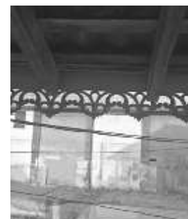
Figure 11- Liyawal designs on the valence boards