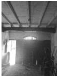
Figure 5- Interior walls in pink

Doors- A row of doors each four sashed align at the entrance in the verandah. Two of these doors had an arched fanlight with several bars introduced on the top. These fanlights originated during the Dutch period and were carried through into the British period,