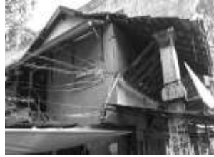
Figure 15-there is no balcony, props used

Unlike the Ambalangoda and Hingula shophouses where there a few columns on the verandah these shophouses have just two enormous standing columns on the two edges supporting the structure above. These shophouses don't have a balcony in particular, however the props are fixed at an angle as it supports the extended eave of the roof. So if the trellised window is open there is a sense of feeling that corresponds to a feeling at a balcony (Fig 15).