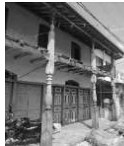
Figure 8- the beautifully carved column

Other Architectural Elements- There are continuous columns from the ground floor to the first floor. The columns are attached onto a pole plate to bare the weight. Out of the three case studies, one shophouse had some exquisitely crafted columns. Basically these are two columns joined together. There is a wider bottom part and then there is a tapering with moldings. Then the column head of the first column acts as the base for the extension of the upper column. In this way these columns do not have bases, this aspect highlights the roof (Fig8). There is a pilakotta, on one side wall embedding a part of the column in the verandah which creates an in-built seat. (Fig 9). These features enhance social actions of people.