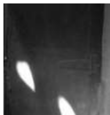
Figure 7: Iron door hinges

providing light and ventilation into the interiors. Since shophouses were the houses of the poor there was not much decoration on the fanlights. Massive door hinges, a Dutch