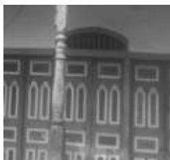
Figure 6: The arched fanlight above the doors, Source- Author

Doors- A row of doors each four sashed align at the entrance in the verandah. Two of these doors had an arched fanlight with several bars introduced on the top. These fanlights originated during the Dutch period and were carried through into the British period,