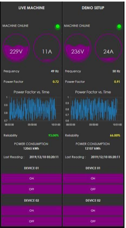
Figure 2: The mobile application

The voltages, currents, active powers, apparent powers and reactive powers, frequencies and power factors of the supply and machine are monitored in real time using this device. Through a custommade PCB, information from the power analyzer is processed and sent to our mobile application wirelessly. This wireless network is made with a Wi-Fi module fixed in the PCB, which then communicates with the devices we have the mobile application installed.