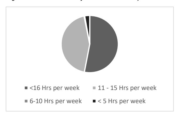
Figure ii: Screen time use of Children above 12 years n-453