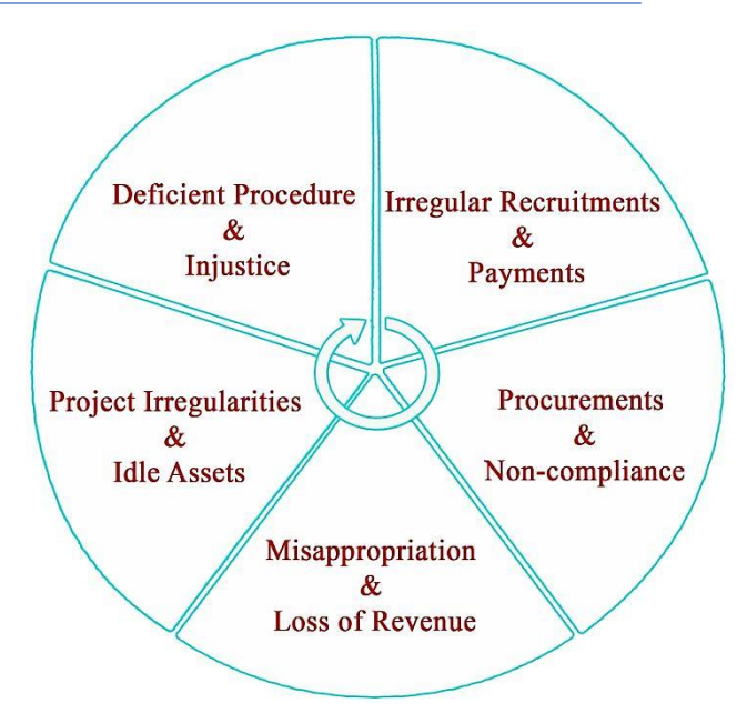
Figure 1: The five segments of viciousness of corruption circle

Corruption has not just declined services but increased expenditure. It makes the state less able and vulnerable to its all sorts of challenges, and it becomes victim of its own progress by reason of vicious trends of recruitment, procurement, payment, projects, etc. A prerequisite is here to come across the nature before responding or even to present the result, the uniqueness of corruption at home. There is no escaping the fact that either the policymakers or anyone cannot take a blind bit of notice of what the viciousness of corruption circle is all about beyond a shadow of a doubt. The circle is best broken into five different and also interconnected segments. Although the result derives from the context of Sri Lanka, this classification seemingly generalizes occurrences out too.