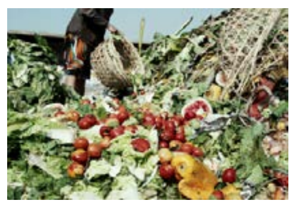
Figure 3. Food Wastage

loss of food also means as the loss of nutrition which is occurring due to the worsening quality or degrade of nutritious crops. Food which are rich in nutrients such as fruits and vegetables have the rate of wastage which are higher than any other food product. Although there is only an inadequate amount of information about the loss in micronutrients in food value chains, an occurrence in the loss of Vitamin A from the loss and wastage of food has been assessed via studies. In view of the insufficient micronutrients globally, the loss of nutrients could have turn resulted in momentous impacts on the efforts that are taken to lower the amount of unseen hunger and undernutrition. ("Reducing food loss is key to end hunger and undernutrition by 2025 | IFPRI," n.d.)