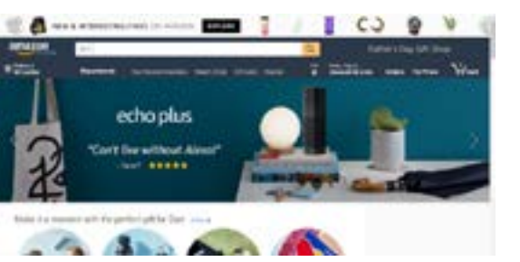
Figure 1. Graphical User Interface of an e-commerce website

The interface of amazon.com and Royal Flora Holland seems user-friendly almost for any person who even has a moderate level of knowledge in the English Language. Whereas for non-English literates in rural areas, such interfaces appear to be complicated and hard to understand since language translation into Sinhala is not available in these above-mentioned sites.