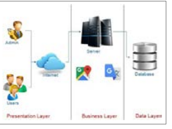
Figure 5. Design architecture of the proposed system

The Figure 5 below shows the layered design architecture for the proposed e-commerce web application.