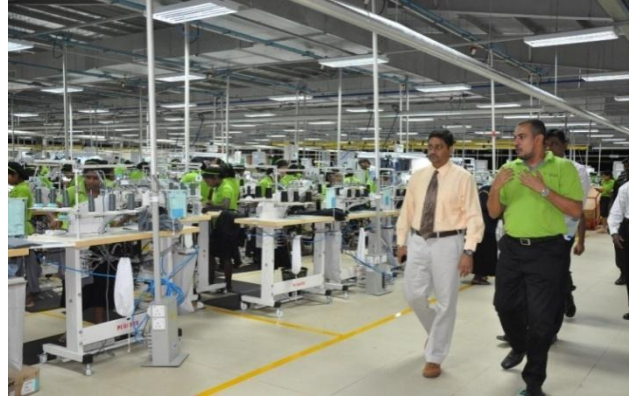
Author visiting MAS VAANAVIL, 13 July 2014

explaining the vision of this venture mentioned that after the war ended, it was decided by his company to establish this factory especially to assist the community in finding jobs. There are over 1000 workers at present and out of which only less than 2% are from outside district. This factory was established in 2012 and is still expanding. The workers in the factory are 99% local females and they are being provided with meals and transport besides a lucrative salary by the management.