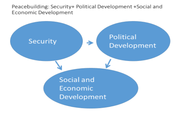
Picture 1 examines the holistic approach to second generation of peacebuilding.

The core argument of the module is a holistic approach to a long term peacebuilding initiative of the post-conflict scenario. While it is dealt with an immediate post-conflict recovery, it is mainly focused on pre and future conditions of the conflict nature of a country. In this regard, security, political and socio economic aspects taken into consideration in peacebuilding and conflict transformation of a conflict affected country. Security sector reform, institutional reform, political transformation, judicial reform, economic recovery and civic engagement are some of the key areas that the second generation of the peacebuilding is looking into the agenda.